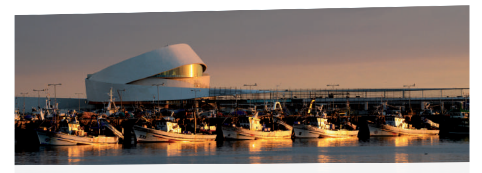
"The construction of an analytical model from the concept of S3 is crucial for the engagement of the stakeholders in the identification and characterisation of the priority domains"

Finally, the third corner incorporates advanced users of innovation which are companies and other institutions that produce goods and services to meet demand (both domestic and international, including public procurement). Evaluating their needs is fundamental to the viability of S3 domains and also serves to inform policies that promote structural changes in the regional economy. Following this analytical model we pre-identified eight priority domains categorised as nuclear (proven), emerging or "wild card", which were then fully discussed by stakeholders of the quadruple helix to refine and integrate into our S3.