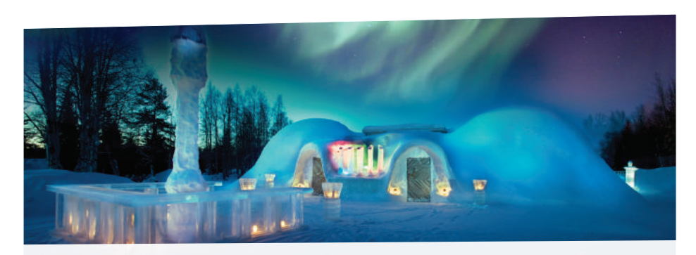
"We are working towards our vision of promoting regional clusters and ecosystems of emerging industries that focus on refining natural resources throughout value chains"

We are working towards our vision of promoting regional clusters and ecosystems of emerging industries that focus on refining natural resources throughout value chains. In addition to our strong traditional sectors, Smart Specialisation focuses on cross-cutting interventions. With the modern clusters of Arctic industry-Circular economy, Arctic Smart Rural Communities, Arctic Design, Arctic Safety & Security and Arctic Development Environments, we are looking beyond the boundaries, promoting cross-fertilisation, the best use of the regional expertise and strategic networking outside the region.