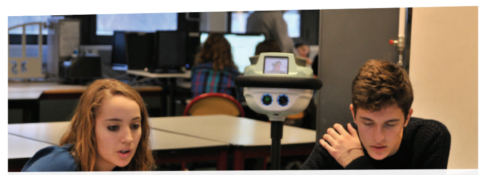
"A dedicated governance structure brings together the key stakeholders with support of a collaborative online platform"

As part of the S3 policy mix, an action plan builds awareness of innovative public procurement, identifies territorial needs, facilitates meetings between buyers and suppliers, and finances studies into innovative procurement projects. A dedicated governance structure brings together the key stakeholders with support of a collaborative online platform. We have already moved from strategy to action: Financed through the regional OP, a call for expression of interest named Innov'HA was launched in early 2016 that will fund feasibility and opportunity studies as well as legal assistance.