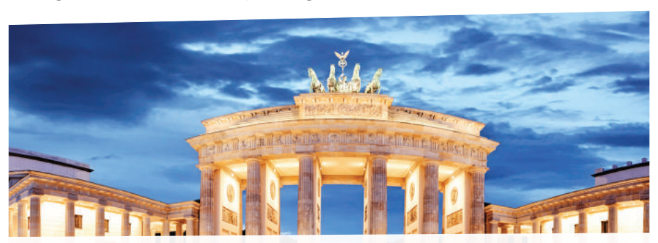
"A comprehensive process takes time, trust and confidence"

What distinguishes our story is the close cooperation between two political-administrative regions that have come together to develop a joint R&I strategy. Based on the understanding that functional regions and their complex interdependencies do not stop at regional borders, innoBB covers both federal states Berlin and Brandenburg. An important lesson is that such a comprehensive process takes time, trust and confidence to find acceptable solutions for issues that arise along the way.