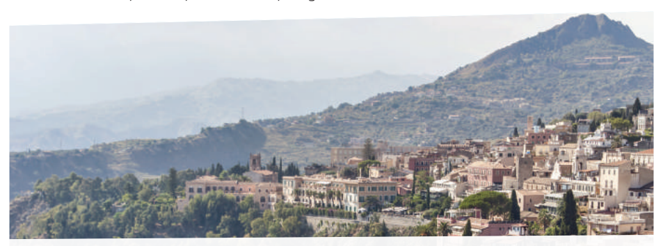
"Social innovation in Sicily already exists, and young people are already working to reinvent their future"

However, innovators have pointed out that most ideas have often failed to get off the ground because they did not pass funding eligibility thresholds. On these and other aspects we have recognised the need for a different governance model. A new cross-departmental structure will coordinate analysis, planning, guidance, and monitoring of S3. This is complemented by permanent thematic groupings that include international partners. The Regional Government has approved Sicily's Smart Specialisation Strategy in February 2015.