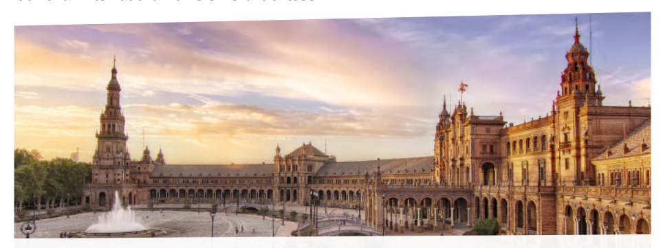
"The Entrepreneurial Discovery Process allowed us to discover transversal opportunities in several of our innovative domains"

Secondly, after prioritising sustainable construction we have an Action Plan with a much more coherent policy mix and a budget of €529 million. This plan aims to make Andalusia an international reference in this area by providing innovative solutions for the global value chain. The Action Plan has also adopted S3 methods including participatory governance, a shared vision, sub-priorities and a monitoring mechanism. We already tasted success last year, being awarded a RegioStar Award for sustainable development, convening an international conference, and participating in the launch of the European Commission's Smart Specialisation Platform for Energy.