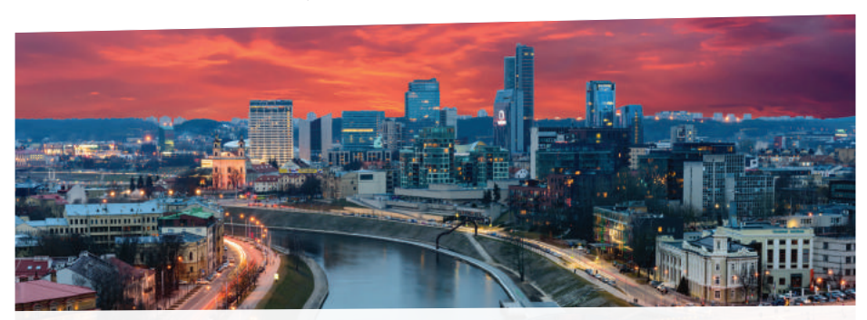
"We have regarded Smart Specialisation as a game-changing opportunity for Lithuania"

Throughout this process there were naturally many different opinions and interests and sometimes even complaints on the table of the Prime Minister, but eventually everything worked out well and it was a great exercise for better and closer collaboration between our stakeholders. The final decisions on S3 priorities and the framework for implementation were taken at the highest political level to avoid the risk of diverging interests and questioning of priorities during implementation.