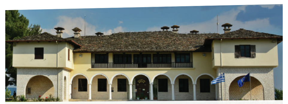
"Efficient governance of an ongoing entrepreneurial discovery process is essential and structures were carefully designed with this in mind"

Last June we established the Regional Research and Innovation Council (PSEK) and four working groups relevant to the areas of specialisation. The region has also set up a "Secretariat for entrepreneurial discovery and investments" to support continuous identification of new ideas. Based on the results of an entrepreneurial discovery process we published a revised and more effective version of our S3 in March 2016. We have also developed a "Manual for entrepreneurial discovery" presenting the concept and our regional needs in non-technical language.