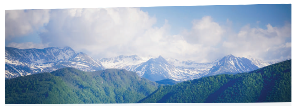
"We still have many challenges, but have found inspiration through international cooperation, including the S3 Platform peer review"

We have worked intensively with experts from SNN, receiving support from local stakeholders and the European Commission's Regions Peer to Peer TAIEX programme. Results are already visible: Potential common priorities (agro food, waste, water, new materials and energy) have been mapped based on value chain principles. A governance and coordination system is being constructed with widespread stakeholder participation, and sources of finance have been identified. Perhaps most importantly, lessons have been learned on how to understand each other's development needs and how to approach intercultural communication.