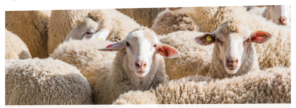
"The results so far show promising advances in the areas of reinforced innovation at local level and support for a more rounded perspective on rural development"

A first project, currently ongoing, is the Farmers School of XXI that emerged from a "grassroots" initiative during interactions within the TAGUS Innovation Ecosystem promoted by the Smart LEADER process and involving all actors of the Quadruple Helix Model, citizens included. The knowledge institutions participating in the Shepherding School project are the Faculty of Veterinary Medicine at the University of Extremadura (Caceres) and CYCITEX, the Centre for Scientific and Technological Research of Extremadura (Merida). The Shepherding School aims to become a valuable resource for training highly professional shepherds embracing ICT and latest technological advances in the field