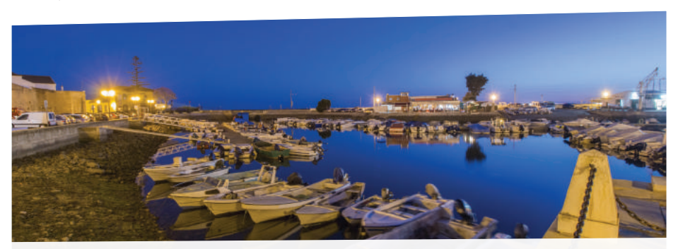
"Smart Specialisation could transform Algarve's economy into one based on knowledge, competitiveness and resilience"

The challenge is substantial, but embracing experimentation and novelty is what we need. If the process of strategy formation can be followed with concrete implementation, Smart Specialisation could transform Algarve's economy into one based on knowledge, competitiveness and resilience.