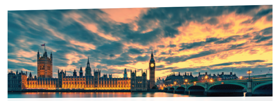
"The real benefits of Smart Specialisation cannot be felt only through written strategies, but that the concept must continue to change the way people think and act"

Despite their relative infancy some LEPs have developed fully fledged strategies and took part in the S3 Platform peer review workshops (e.g. Manchester and Cornwall). Nevertheless, we recognised their need for more support. Taking inspiration from the S3 Platform, we have used ERDF technical assistance to set up the Smart Specialisation Hub, directed by a specific sub-committee of the ESIF PMC. The experience of LEPs and the Hub so far is that the real benefits of Smart Specialisation cannot be felt only through written strategies, but that the concept must continue to change the way people think and act.