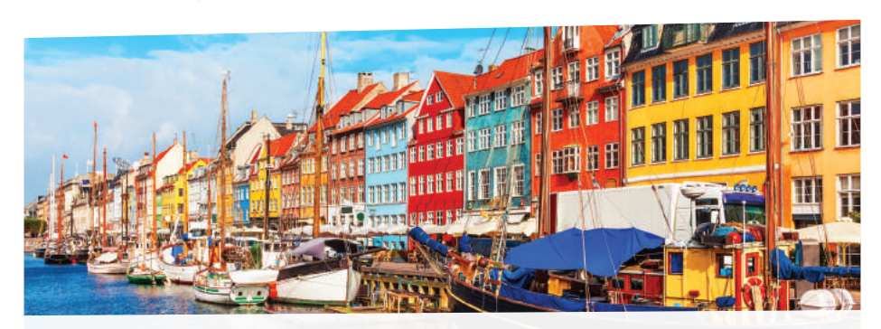
"Smart Specialisation [...] has highlighted the need to concentrate, prioritise and think bigger in terms of future R&I domains"

Publicly available regional partnership agreements define common objectives and activities. While neither legally binding nor supported by funding, they embody the overall agreement between regions and the national government. The secretariat of the Growth Council monitors the progress of these agreements in a simple dashboard that is shared internally. Smart Specialisation has further institutionalised this process by making it more structured, highlighting the need to concentrate, prioritise and think bigger in terms of future R&I domains.