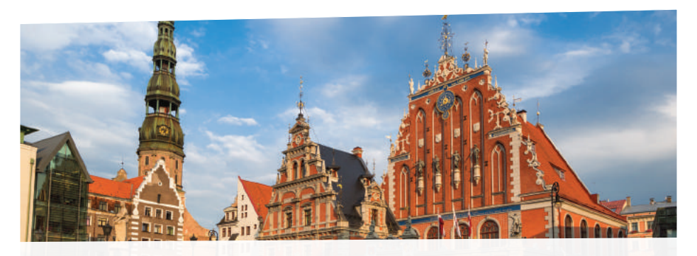
"The Latvian S3 aims to introduce change and growth [...] in activities with significant horizontal impact and which contribute to transforming the national economy"

In 2015 descriptions of the ecosystems surrounding each specialisation were elaborated, to introduce actors in the quadruple helix to the context in which knowledge is created including the scale of each area, core challenges, public funds and regulations. In 2016 a three-level monitoring system was launched to monitor the impact of public investment through S3, which by 2020 will amount to more than a billion euros