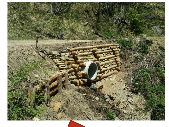
Beter protection of territory and environment

New employees whit high professional skills